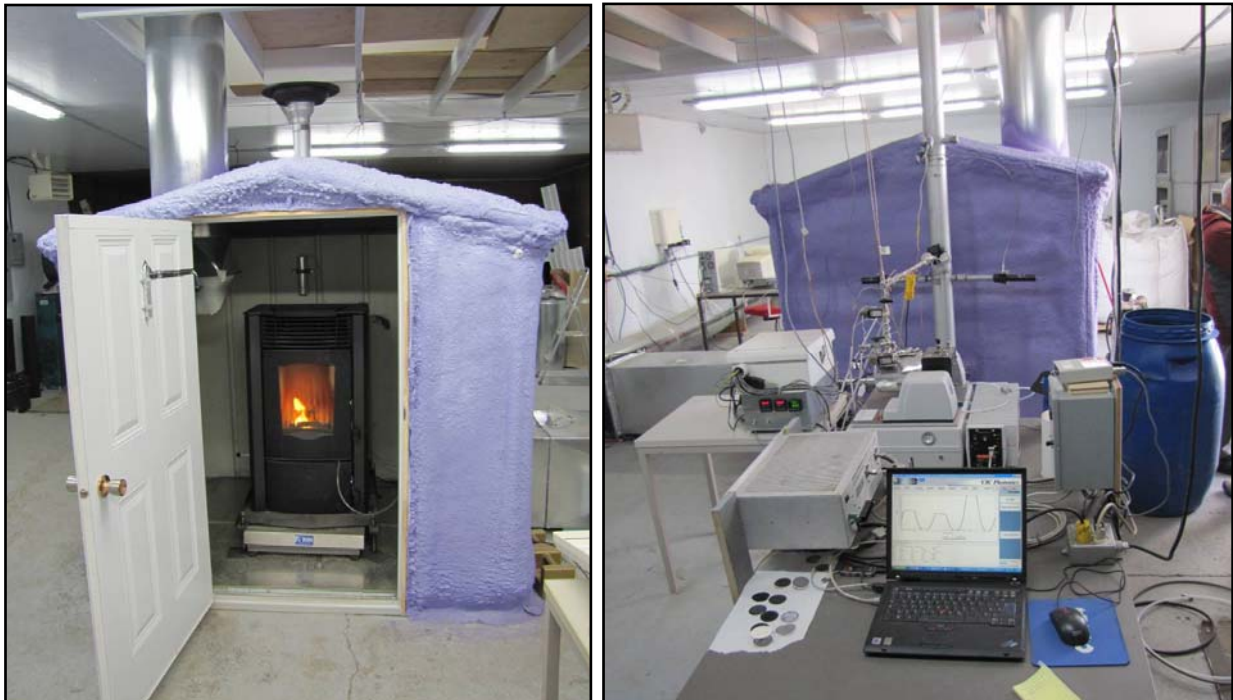
Fig. 2. Biomass combustion test setup, front view (left) and rear view (right).

order to measure conductive heat losses. Measurements were collected every 10 minutes by a data logger.